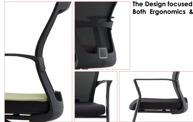
The Design focused on Achieving Both Ergonomics & Functionality

Ergonomics is commonly thought of as the way companies customize procedures, work areas and break rooms to maximize productivity while minimizing worker fatigue and discomfort. We now that keeping your personnel energized and comfortable is important for lowering stress and maintaining job satisfaction.