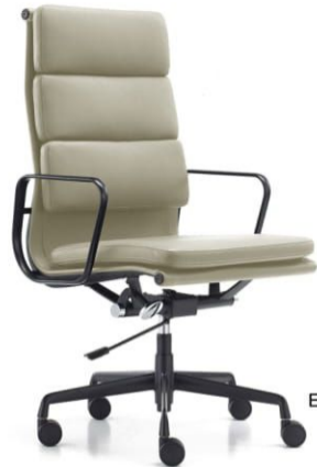
EXA HIGH BACK