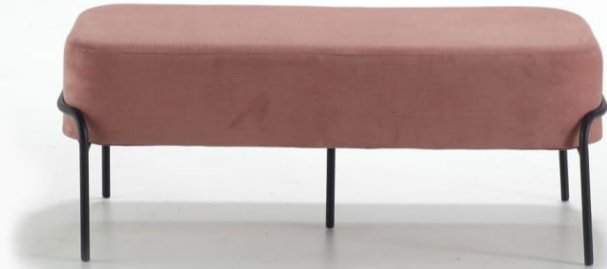
Cube Maxi 120D X 50W X 40H cm