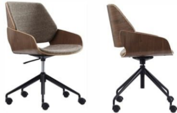
N A W R A

This chair features a harmonious blend of walnut bentwood and soft fabric, combining natural warmth with modern comfort. The bentwood frame, crafted from rich walnut finishing, is meticulously curved to offer both aesthetic appeal and durability. The seating and backrest are upholstered in a plush fabric, ensuring a comfortable experience for extended use. Additionally, the chair is equipped with a Korean-standard gas lift mechanism, offering adjustable height and smooth movement. Perfect for any modern living space or office, this chair merges style with functionality for a cozy and refined seating experience.