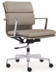
EXA LOW BACK