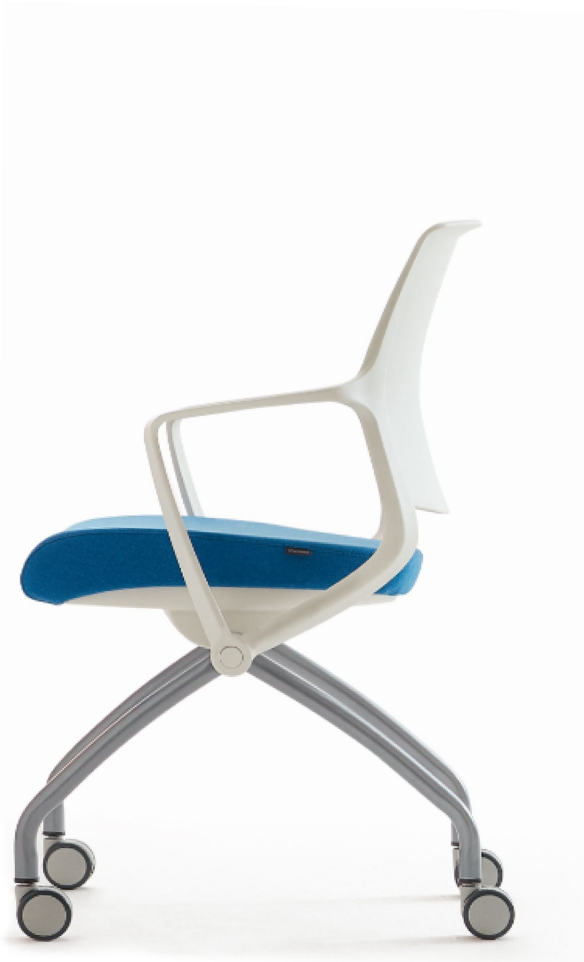
A4 SEAT FOLDING/ STACKABLE SYSTEM