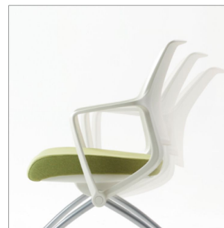
High-density Seat PU Foam with Folding Function